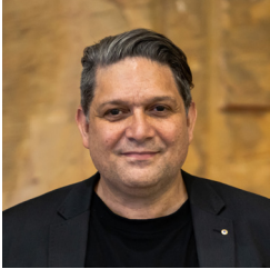
Wesley Enoch AM

Wesley Enoch has written and directed iconic Indigenous productions THE 7 STAGES OF GRIEVING , BLACK MEDEA and THE STORY OF THE MIRACLES AT COOKIE'S TABLE .